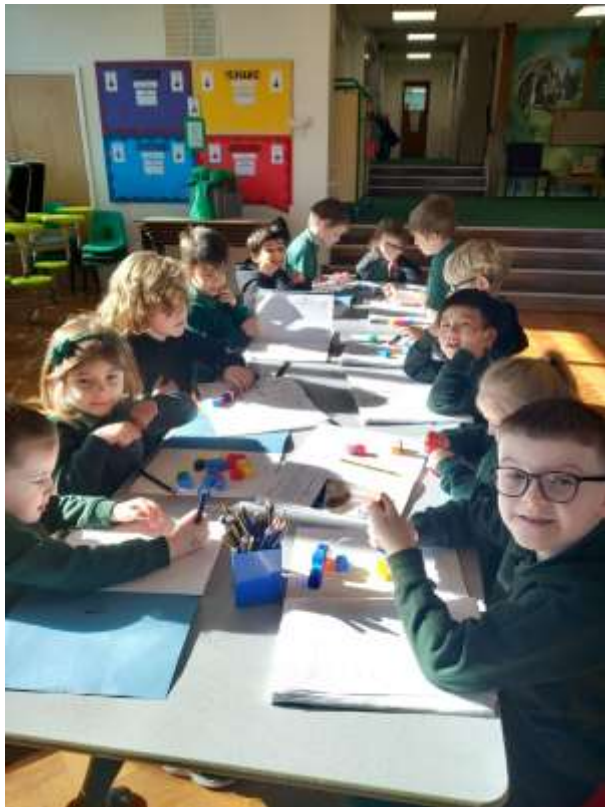
7 - Class 2 Maths Lesson