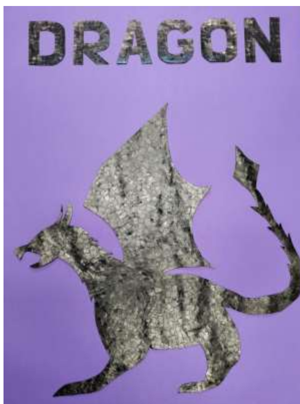
4 - Dragon House