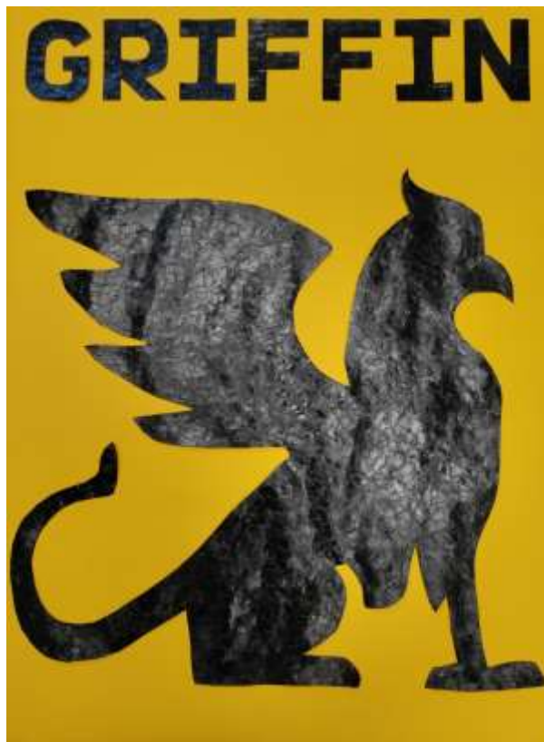
3 - Griffin House