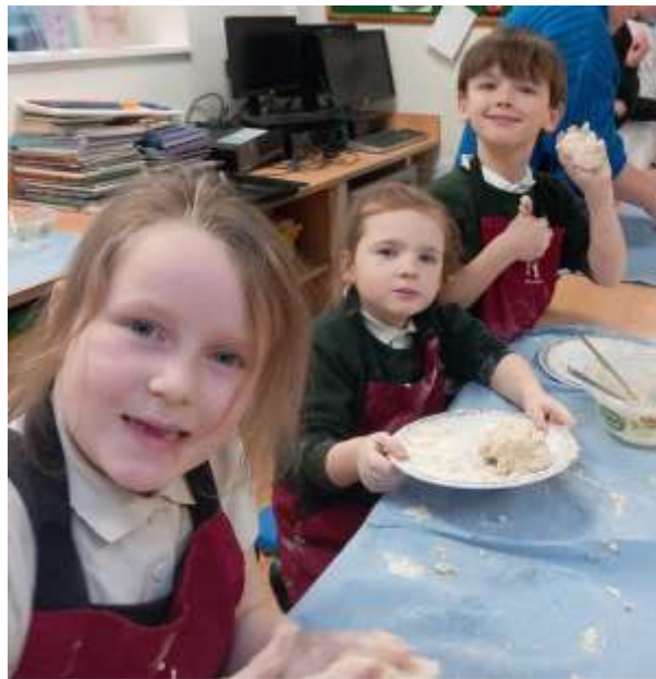
6 - Cooking clubs Scones this week.