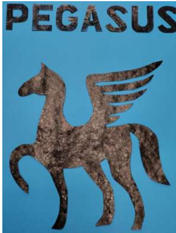
5 - Pegasus House