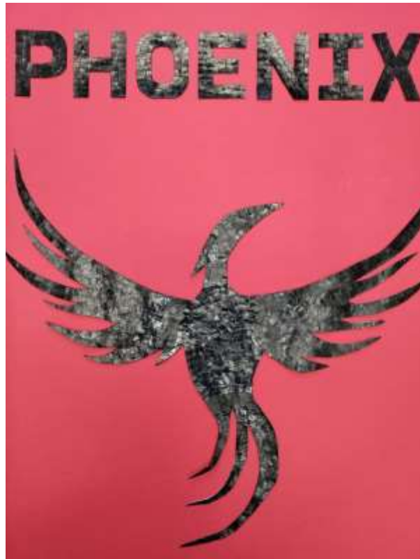
2 - Phoenix House