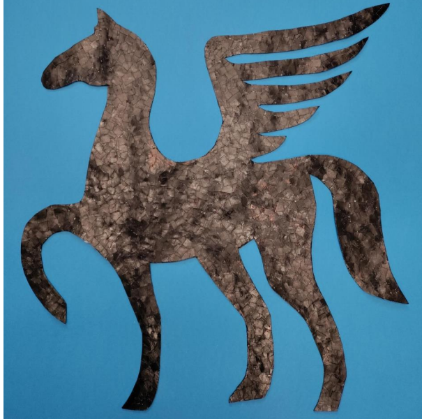
4 - Pegasus House