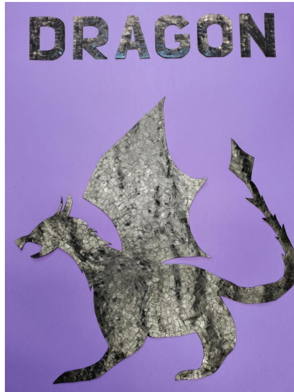
2 - Dragon House