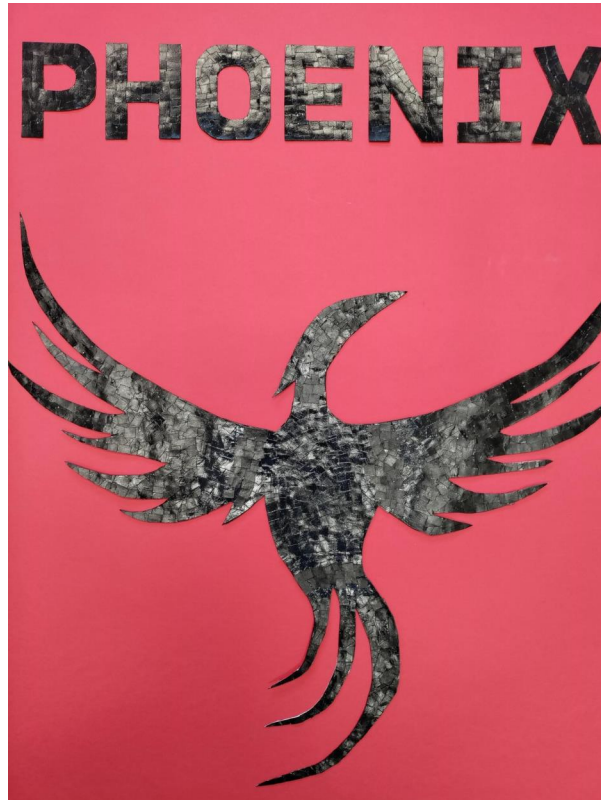
1 - Phoenix House