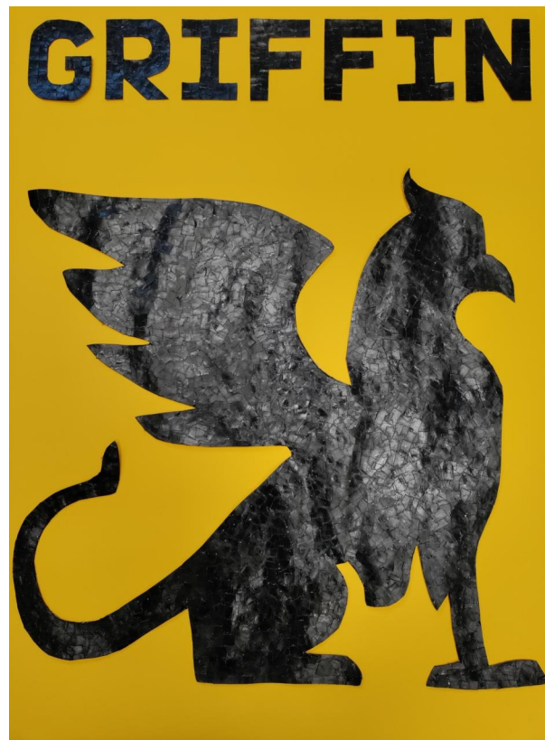
3 - Griffin House